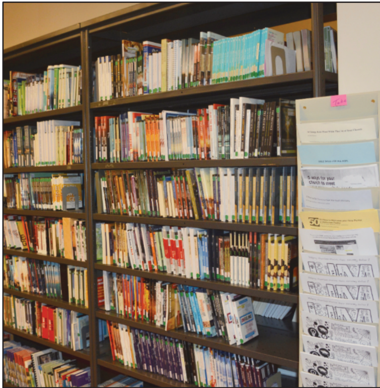
More than 24 shelving units line the UMRC's collection at Kumler Outreach Ministries in Springfield.