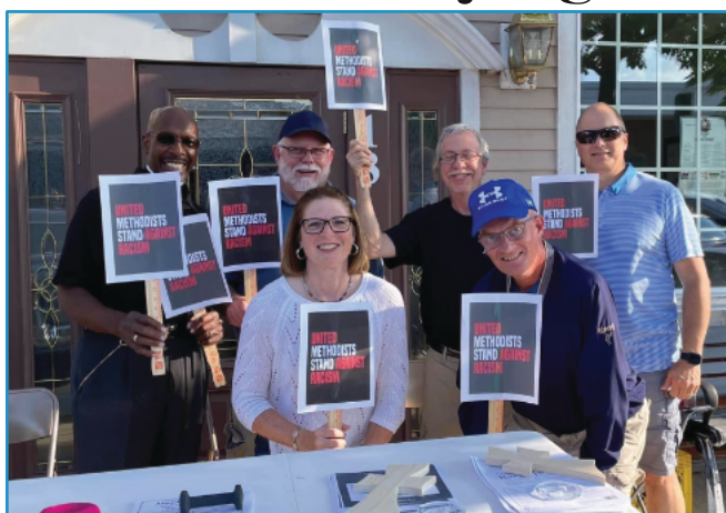
Members at Cary UMC participated in the church's DIY Rally Against Racism event by showing their support at an information table during the Cary Cruise Night event on July 20.

► Find resources at umcnic.org/antiracism .