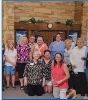
6 Pastor's Apportionment Challenge to Congregation