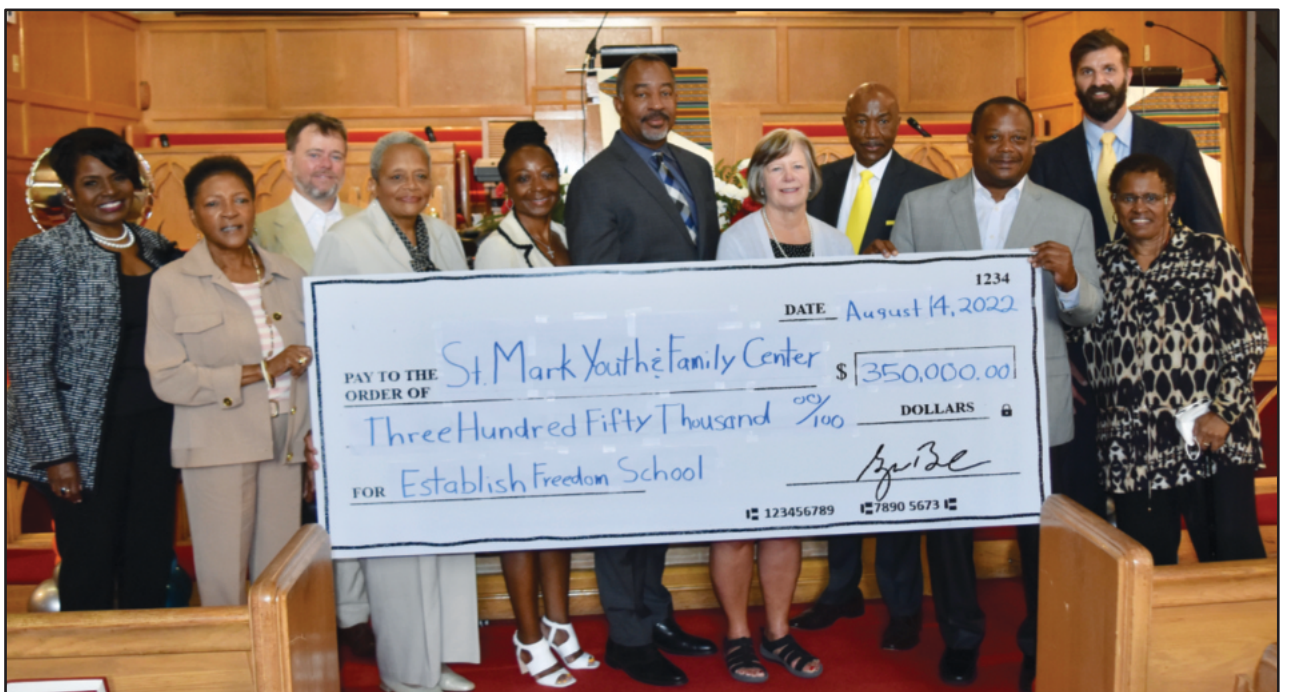
St. Mark UMC leaders and guests celebrate a $350,000 yearly grant for three years to open a Freedom School to support students in the Chatham neighborhood in Chicago.

(continued on page 3, see from the cover)