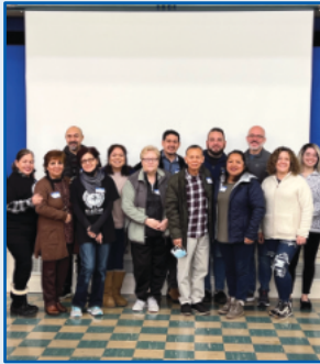
3 Spanish Licensing School Provides Opportunity