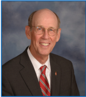
2 From Your Bishop: Boy Scouts and Evangelism