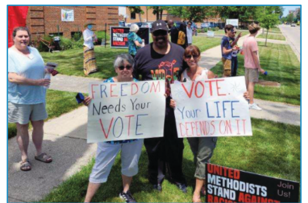
Church and community members gathered on the First United Methodist Church lawn in Elmhurst to celebrate Juneteenth with music, education, and guest speakers from the DuPage County NAACP. The event ended with a lively rally on York Road where people rang cowbells and raised their anti-racist signs telling those who passed the church that United Methodists Stand Against racism.