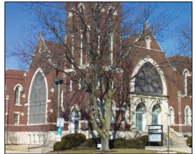
The congregation has been worshipping in their building on the corner of Fourth and Oak Streets in downtown DeKalb since the early 1900's.

First United UMC of DeKalb has affirmed that it is truly amazing what God can do through us, through a community on a journey grounded in gratitude, revealed in prayer, and lived in faith. And that miracles do happen.