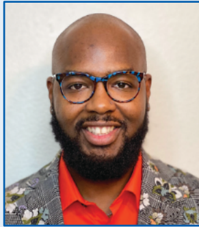
5 New Campus Minister at Inclusive Collective