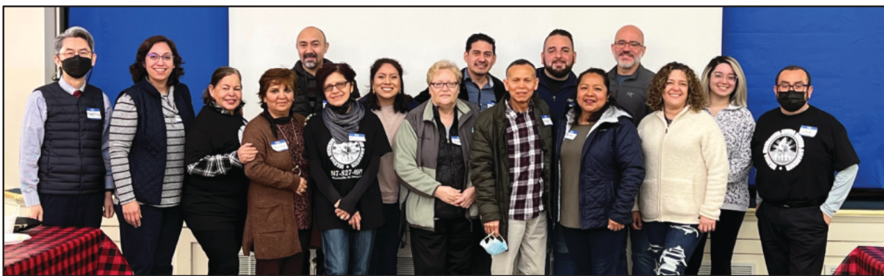
A large group of Hispanic/Latinx local pastors take the next steps to become licensed through a program at Garrett taught in Spanish.