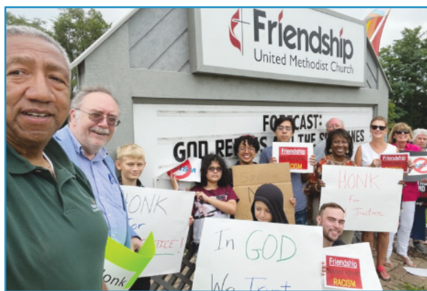
Approximately 1,400 cars passed by Friendship UMC in Bolingbrook on Aug. 14 as members participated in the 2nd Annual DIY Rally Against Racism event sponsored by the NIC Anti-Racism Task Force. This year, the church's Faith Formation ministry team incorporated this activity into their Intentional Discipleship System's community engagement efforts.

► Find resources at umcnic.org/antiracism .