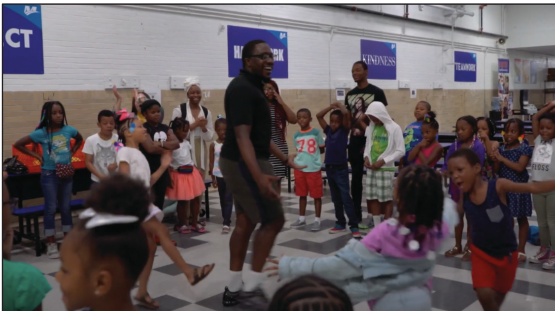
Children at many Freedom Schools start the day with a Harambee ritual. Harambee in Swahili means “Let’s Pull together.”