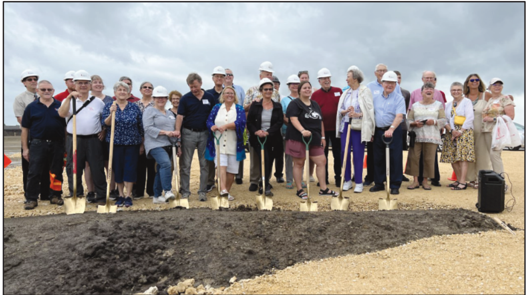
Church leaders and members participate in the official groundbreaking ceremony held July 24.

It was a glorious day for First United Methodist Church of DeKalb on Sunday, July 24, 2022! It was a perfect day for the official groundbreaking for a new church building on 15 acres of land on North Annie Glidden Road – a day that had been in the congregation's hopes, dreams, and prayers for nearly 20 years. The early morning rain left behind a day of blue skies and bright sunshine.