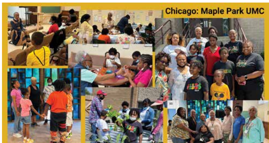
Chicago: Maple Park UMC

Maple Park UMC in Chicago's "Learn, Laugh, and Grow" VBS taught children to be themselves while learning to better themselves. They learned about Bible-based healing and tried their hands at skills and crafts. The church fueled the youngsters every day with breakfast, lunch, and a snack.