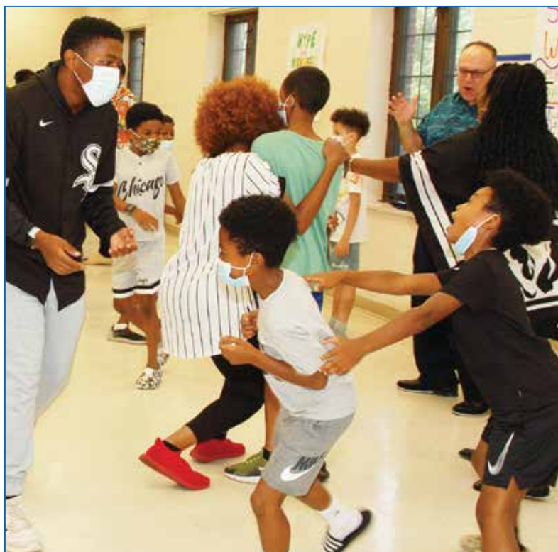
Movement enhances children's learning at Freedom School.

Scholars met at St. Mark five days a week and start with a 9 a.m. breakfast. The youngsters then moved into harambe (a Swahili word that