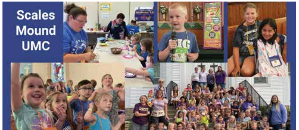
Scales Mound UMC