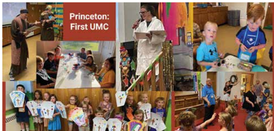
Princeton: First UMC

A number of churches used Cokesbury's "Hero Hotline" curriculum, including First UMC (Des Plaines) , Hinsdale UMC , First UMC (Princeton) , Rochelle UMC , Christ UMC (Rockford) , and Scales Mound UMC . The young participants, called heroes, learned about some heroes in the ultimate Hero Handbook, the Bible. The characters Professor and Super Meer reinforced that answering God's call together means striving for the things that bring peace and build each other up.