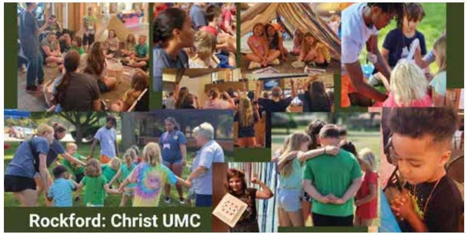
Rockford: Christ UMC