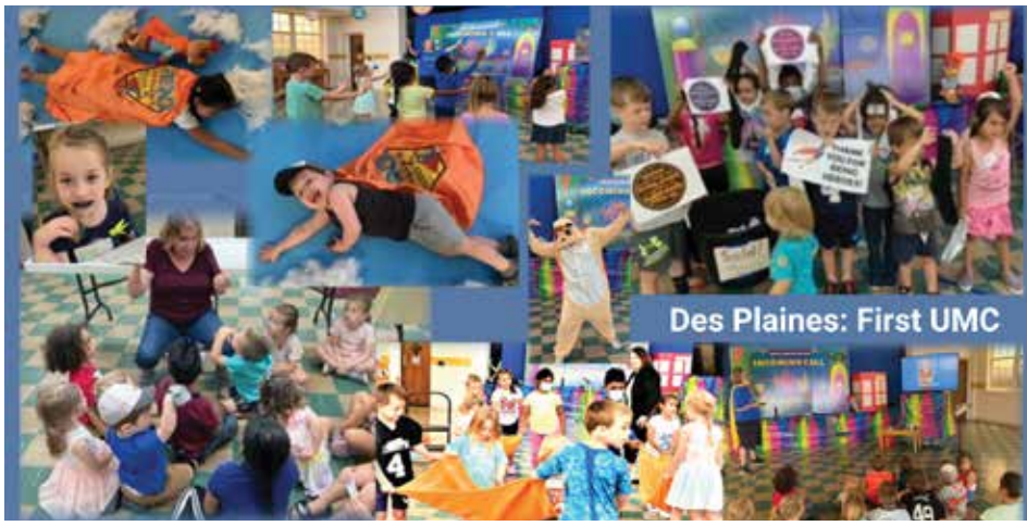
Des Plaines: First UMC