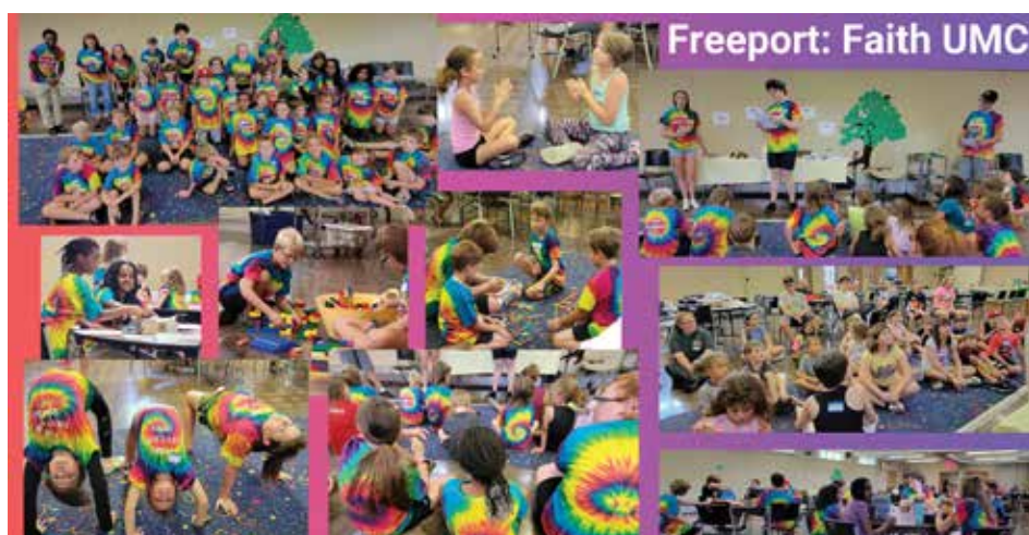
Freeport: Faith UMC

Faith UMC (Freeport) taught children that "We Are All Connected" during their VBS, which was part of their day camp. Wearing matching rainbow tie-dyed shirts, children participated in many activities that even included a pool party.