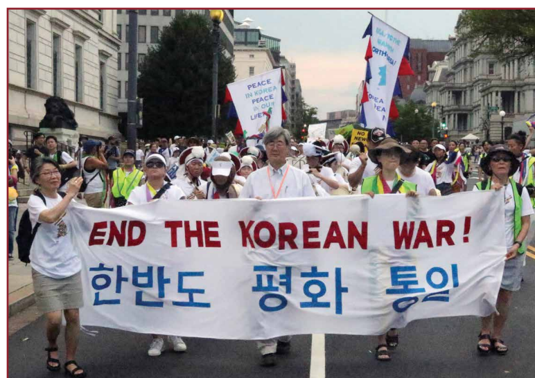
Hundreds of Korea Peace Action participants march from Lafayette Square in front of the White House to the Lincoln Memorial in Washington, D.C., on July 27, the 70th anniversary of the Armistice Agreement of the Korean War.

"Can you imagine being separated from family for, let's say, seven months? Would you be OK with that? Seventy years?"