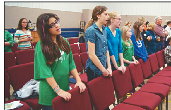
The New Life UM congregation remains dedicated to ministry in the community and will still worship in the former Hilltop Ministry Center which was purchased by Easterseals.

On that land where crops were once harvested, people's lives will continue to be touched and changed and made new through the ongoing ministry of New Life and through the loving work of Easterseals. And that original farm homestead includes 10 acres that the NIC has for future ministry needs. Thanks be to God for new possibilities!