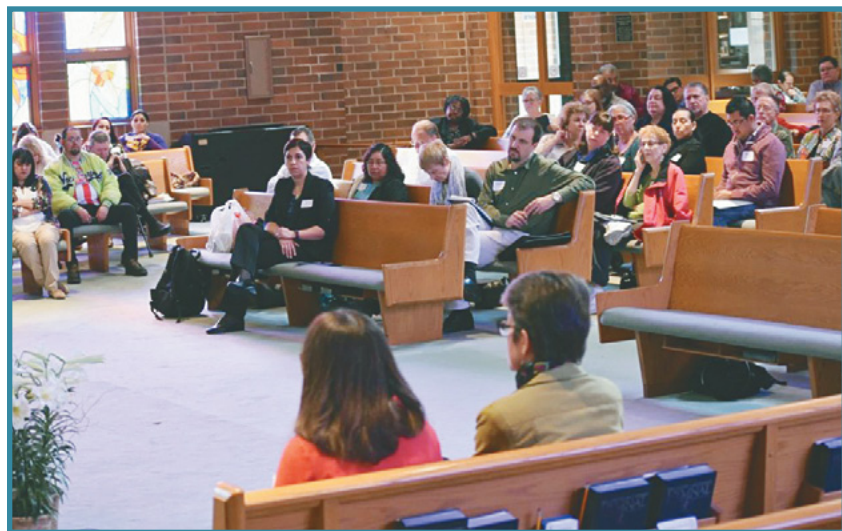
Nearly 120 people from across the Northern Illinois Conference attended a day-long event to share stories and connect around immigration issues.

For more info on NIJFON visit: www.nijfon.org and for a list of other resources provided at the event, including what The United Methodist Church says about immigration, facts and figures and tool-kits for churches, go to: www.umcnic.org/immigrationresources .