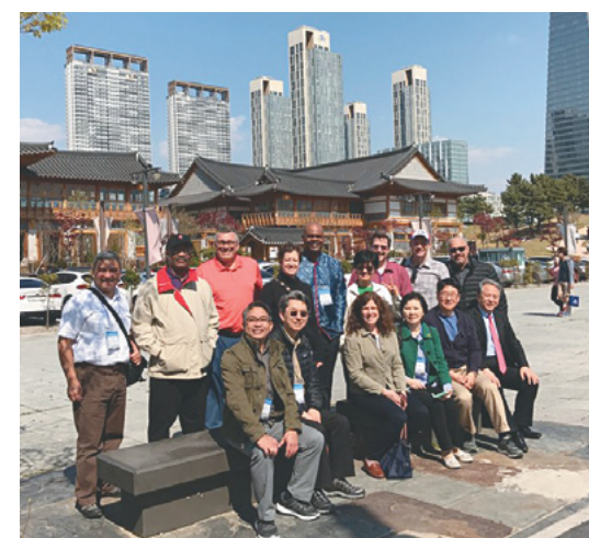
14 people traveled to South Korea April 19-27 as part of the 2017 Vital Church Immersion Experience organized by the Northern Illinois Conference's Institute for Congregational Development. The group rose every morning at 5 a.m. for prayer services and visited the Demilitarized Zone (DMZ) to pray for peace.

There have been too few times in my life where I have felt overwhelmed by God's love. I've rarely doubted God's love for me, but it's always felt like it was just enough. But that's more my issue than God's. The kindness after kindness shown by us by the members of Bupyeong reminded me that God's love is never just enough. As First Timothy reminds me, God's grace overflows. It spills over. It, frankly, can make a mess, which can make me feel uncomfortable. I confess to wanting that love meted out just so. But the hospitality of Bupyeong reminded me that it's OK to receive the overflow and grab a cup to receive even more so that, as Paul notes in Philippians 1:9, my love for God and neighbor might overflow more and more.