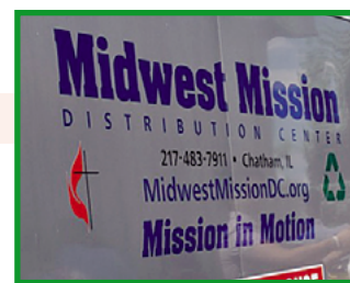
Mission Truck Filled ... 4