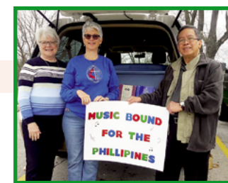
Music to Philippines ... 7