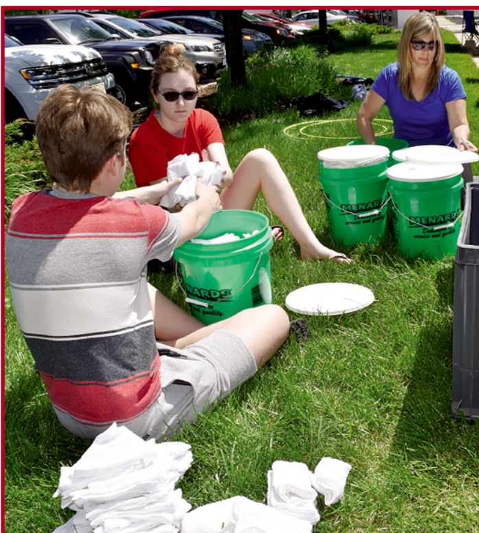
Youth from Our Saviour's UMC in Schaumburg help sort items donated for personal hygiene kits for the Midwest Mission Distribution Center.

Many people around the world and around the corner will have a new clean towel, soap, a toothbrush, and many other personal hygiene items to help them through a disaster or humanitarian crisis thanks to Northern Illinois United Methodists.