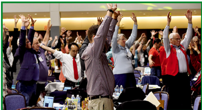
Wespath leads participants in a stretch break following several rounds of voting.