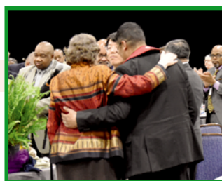
Celebrating our Retirees ... 8 - 9