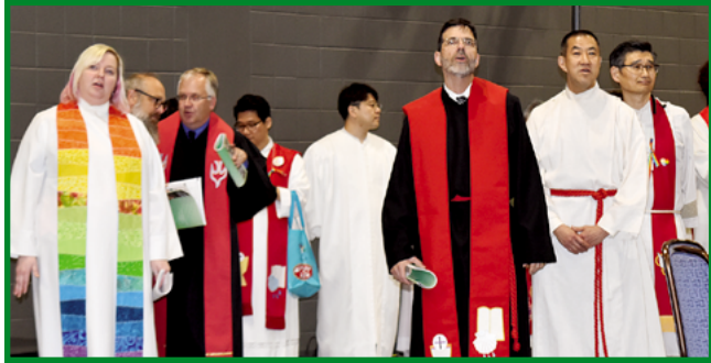
Clergy line up for the procession into the Ordination and Commissioning Service, which opened the 2019 Annual Conference.