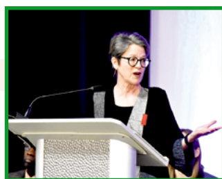
Bishop's Episcopal Address ... 2