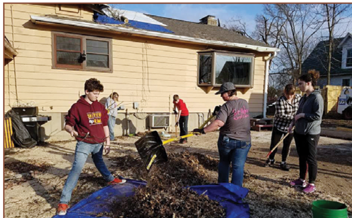
Youth and adult volunteers from First UMC in Ottawa grab rakes and garbage bags to clean up yards of downed trees and debris.

She said the night of the tornado youth from Ottawa FUMC sent her texts asking ‘how they could help’. The next morning