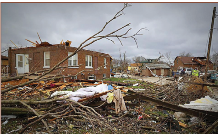
Several EF3 tornadoes left a trail of destruction through north-central Illinois on Feb. 28.

When an EF3 tornado barreled through the small communities of Ottawa and Naplate in north-central Illinois on Feb. 28, there was an immediate response to help from United Methodists.