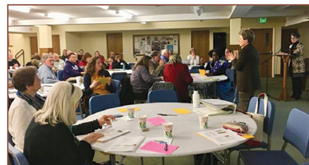
Clergy and laity attended listening sessions in March to provide input to the Organizational Task Force's restructuring plans.

The Task Force met again in March and incorporated the input from the three listening sessions to help craft its final proposed legislation, which will be available to download and review online at www.umcnic.org/AC2017 by May 1. It will be voted on at Annual Conference in June.