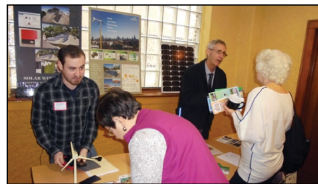
Congregations participated in two Green Fairs held in the Northern Illinois Conference in February and March to learn ways to sustain the Earth.