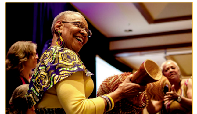
Vibrant worship was a key part of the celebration of 200 years of Methodist mission, sponsored by the United Methodist Board of Global Ministries and Emory University's Candler School of Theology, which drew some 250 participants to Atlanta.