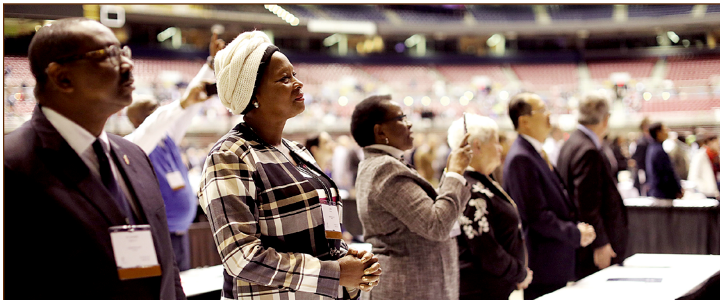
Members of the Judicial Council participate in the Feb. 23 morning of prayer at the 2019 Special Session of the United Methodist General Conference in St. Louis.

Non Profit Org U.S. Postage PAID Permit #130 Homewood, IL