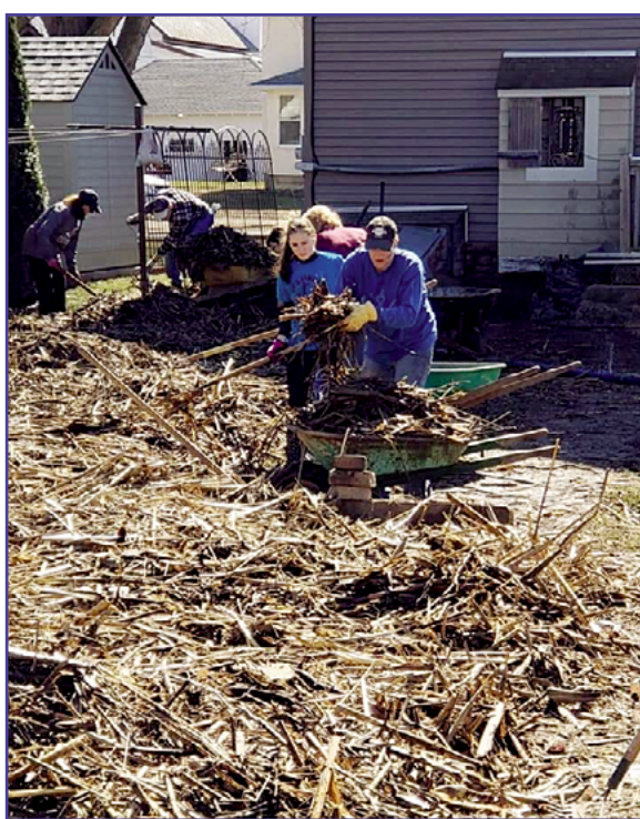
Volunteers pitch in for a community-wide cleanup day to help residents in the small town of McConnell whose homes were flooded after the Pecatonica River overflowed.

McConnell is still recovering. Some people cannot return to their homes due to water and structural damage that will require extensive work or, sadly, demolition. Some residents have returned home and continue with remodeling and cleanup efforts. In all, McConnell UMC helped about 30 households in their flood relief outreach—and they were glad to do it.