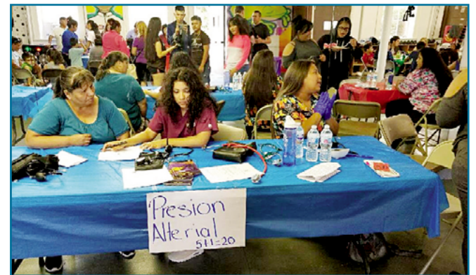
Youth conduct health fair screenings at a Lincoln UMC in Chicago through a unique community training program between the church and local hospitals.