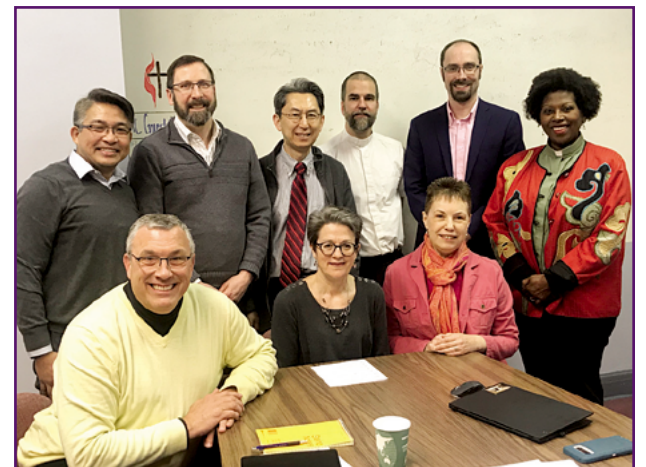
Purple Cow pastors meet with Bishop Sally Dyck to share stories of how the group supports, inspires and holds each other accountable.