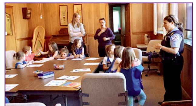
Edison Park UMC opens its church building to the Girl Scouts for the first time. The scouts hold various activities including this career day with a Chicago Police Officer as their guest.

Visit www.umcnic.org/congregationaldevelopment for information on ICD.