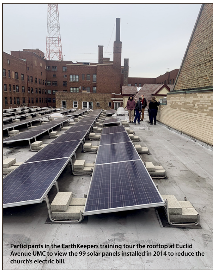
Participants in the EarthKeepers training tour the rooftop at Euclid Avenue UMC to view the 99 solar panels installed in 2014 to reduce the church's electric bill.

Global Ministries commissioned 67 new EarthKeepers from 23 conferences, including 10 from Northern Illinois, in an online service on November 19, 2019. The service affirmed the EarthKeepers in their call to the ministry of creation care and will bless their work in their communities.