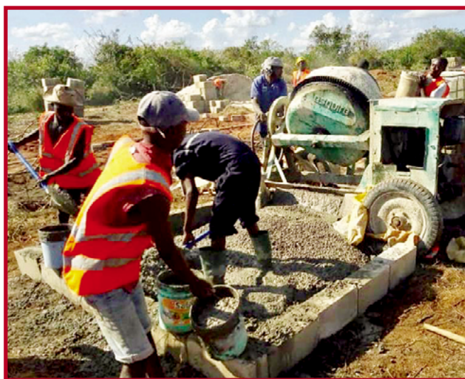
Construction crews clear the area for the future site of the school.

August 27, 2019 was a historic day for me and the future Global Mission Secondary School in Tanzania. After a long wait caused by a United Methodist Church of Tanzania (UMCT) land problem and obtaining necessary permits, a construction contract was finally signed. Immediately, the contractor started site clearance and mobilizations!