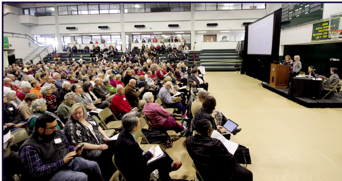
Clergy and laity came together for a Special Session of the Northern Illinois Annual Conference on Nov. 16 at Kishwaukee College in Malta, Ill., to vote on a budget and hear a report from the Exploration Team.