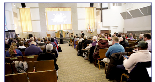
Delegates from the North Central Jurisdiction met for a Pre-General Conference Briefing at First Korean UMC in Wheeling, Ill., to participate in group discussions and open conversations.

The 2020 General Conference will take place May 5-15 in Minneapolis, and the 2020 North Central Jurisdictional Conference will take place July 15-18 in Fort Wayne, Indiana. At General Conference, delegates play a key role in making decisions that impact the future of The United Methodist Church, and at Jurisdictional Conference, delegates elect bishops.