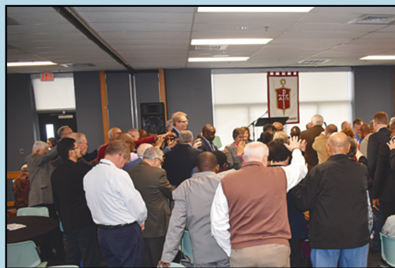
The Council of Bishops prays for the bishops who are members of the Commission on a Way Forward during their November meeting at Lake Junaluska.

The Commission did not express any preference for the sketches that they have developed and likewise, the Council of Bishops did not vote on or eliminate any of the sketches. Through personal and small group reflection, we made lists of strengths and limitations for each of the sketches so that the Commission can consider them as they continue to do their work. We hope that our feedback will strengthen the Commission's work.