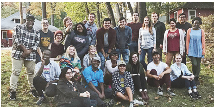
Inclusive Collective hosts a community meal each month to reach out to students and people experiencing homelessness.

Ever wonder what happened to Agape House, the Northern Illinois Conference's (NIC) campus ministry presence at the University of Illinois at Chicago? You may be excited to learn that Agape House now exists as the Inclusive Collective (IC), a vibrant, growing, and diverse campus ministry in Chicagoland. Our hub is the University of Illinois at Chicago (UIC), but we have students involved from several colleges in the city and suburbs.