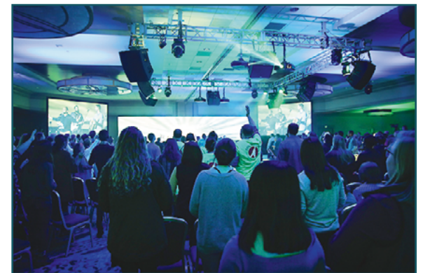
A passionate group of approximately 300 young adults from across The United Methodist Connection gathered in Portland, Oregon November 3-5 to learn more about ministry in The United Methodist Church. Exploration provides these young adults with a space to explore ministry options, gain insight from those in ministry and connect and support others also considering ministry.