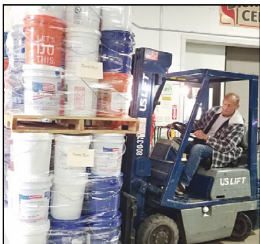
The Midwest Mission Distribution Center continues to be busy this fall loading and shipping hundreds of donations from churches, organizations and individuals for Puerto Rico.