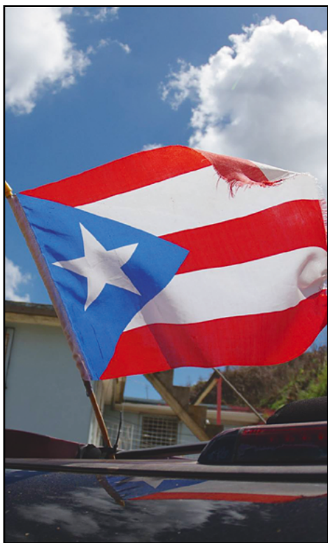
A torn Puerto Rican flag waves from a car a week after Hurricane Maria ravaged the island.

Puerto Rico is rising up from the devastation of Hurricanes Irma and Maria, but the U.S. territory continues to need The United Methodist Church's help.