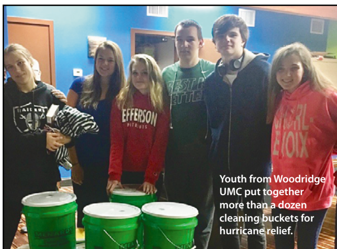
Youth from Woodridge UMC put together more than a dozen cleaning buckets for hurricane relief.

Churches and individuals also can assemble cleaning buckets. Visit midwestmissiondc.org for more info.