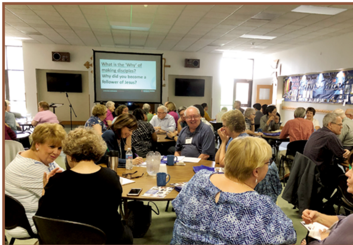
Clergy and laity share ideas and experiences around the 'why', 'what' and 'how' of making disciples at the training session at Our Saviour's UMC in Schaumburg.