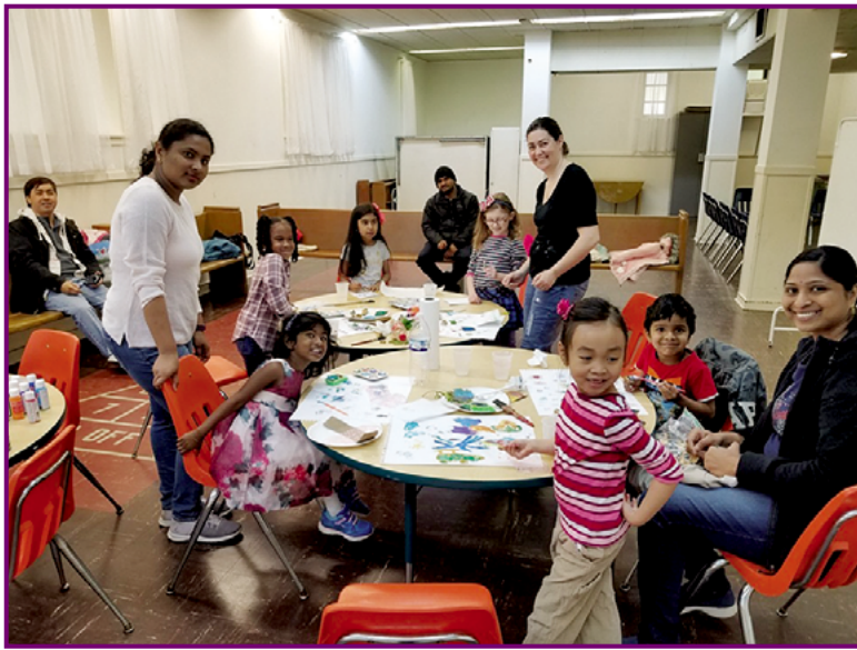
Nearly 50 children learn about art, chess and other activities at a Saturday School organized by West Ridge Community UMC last spring.

For five Saturday mornings last spring, West Ridge Community UMC’s building echoed with laughter and conversations in a multitude of languages including Spanish, English, Urdu, Chinese, and Korean. The church was hosting a free Saturday School, a children’s program made possible by a Creative Ministries Grant from the Northern Illinois Conference.