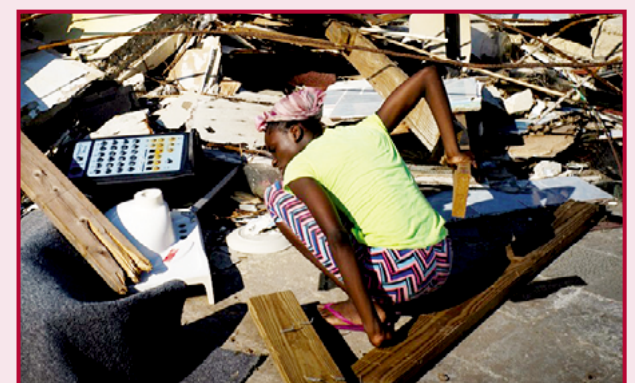
Hurricane Dorian, a record category five storm, caused widespread damage in the Bahamas after pummeling the islands with 185 mph winds, torrential rains and storm surges in early September.

Churches and individuals may also send monetary donations to the United Methodist Committee on Relief (UMCOR) to support International and U.S. disaster relief efforts by visiting www.umcor.org/donate .