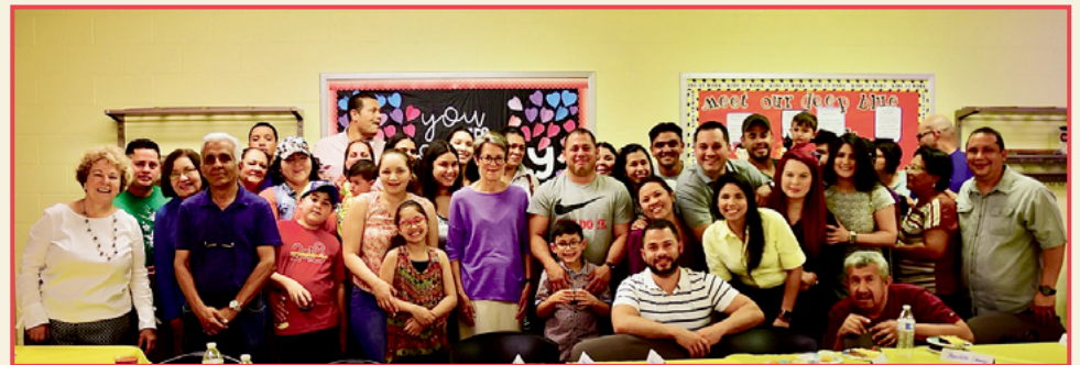
Bishop Sally Dyck visits with Venezuelan immigrants at The Redeemer of Calvary who shared their stories of why they emigrated to Chicago.