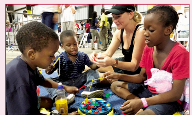
Children play at an evacuation center in the Bahamas.