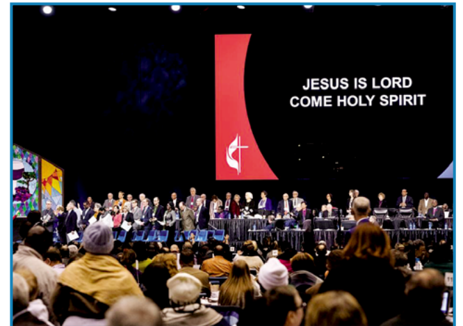
Church leaders gather for the opening of the 2019 United Methodist General Conference in St. Louis.