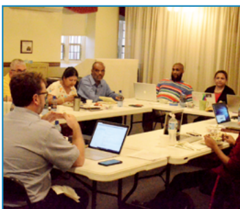
The NIC delegation meets monthly across the conference. They gathered at Wesley UMC in Aurora for their Sept. 15 meeting.

Elected at Annual Conference in June, the Northern Illinois Conference's six lay and six clergy delegates, plus alternates, have been meeting monthly as they prepare for General Conference, set for May 5-15, 2020, in Minneapolis and the Jurisdictional Conference from July 15-18, 2020, in Ft. Wayne, Ind.