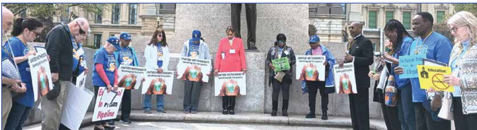
The NIC ARTF group met by the Lincoln statue in front of the Illinois State capitol before the prayer, march, and rally.

State senators and representatives seemed to appreciate not only the dialogue but also our asking how we could help them. Conference members also met support staff,