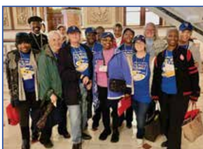
A portion of the group about to tour the capitol building.

There was excitement in the air as participants anticipated dialogue and collaboration with our lawmakers, learning something