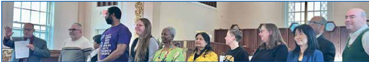
NIC General Conference delegates and reserve delegates receive a blessing at the Delegation Sending Forth Worship on April 7, 2024.

Read what happened at General Conference at umcnic.org/news and umnews.org .