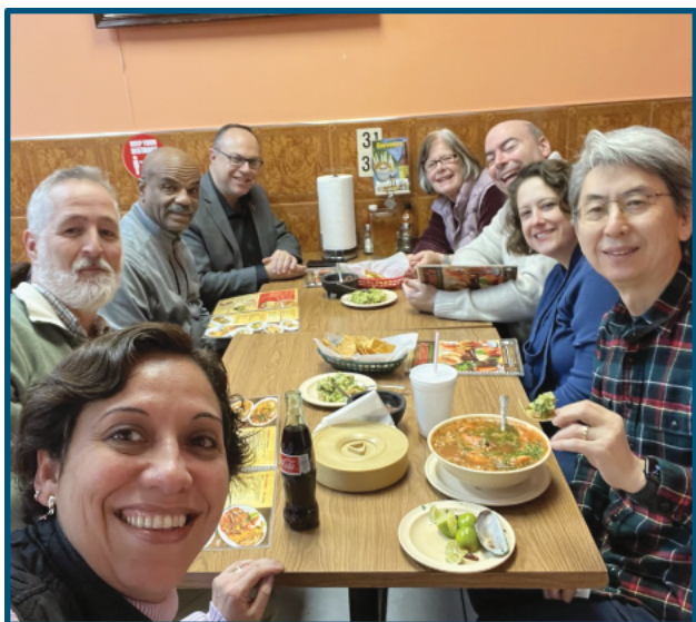
The 2023 Cabinet with Bishop Schwerin having a welcome lunch.