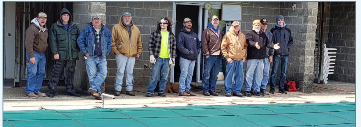
Dedicated volunteers pose in front of the completed pool cover at Camp Reynoldswood

After 18 months and $90,000, Camp Reynoldswood has a new pool that holds water--sans cracks and tripping hazards! In May and June of 2022, major repair work was completed on the aging pool liner, deck, and pool cover at the camp in Dixon, IL. Thank you all for your patience and prayers. We also wish to extend a hearty THANK YOU to the following volunteers who all came together to make this happen: