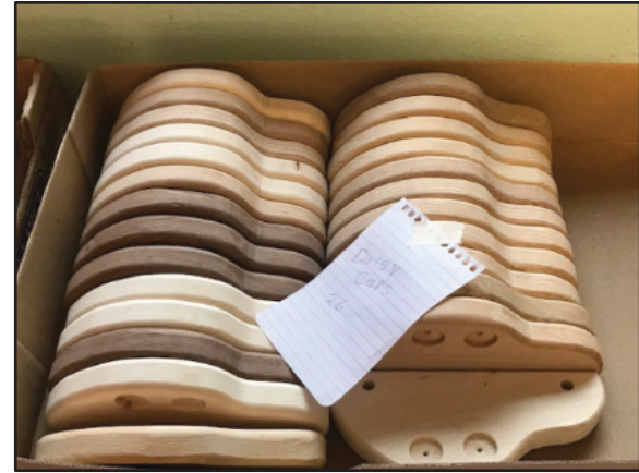
Freshly cut and sanded cars are waiting for their bright coat of paint and daisy details.