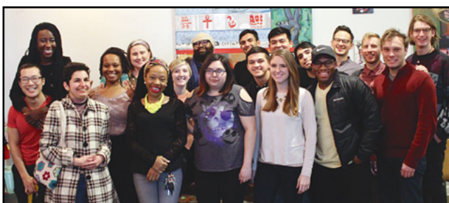
The Inclusive Collective holds a spring justice retreat where students pursue social justice issues.

For more information on the Inclusive Collective visit www.letsgetinclusiveuic.org .