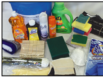
AC Mission Challenge ... 3