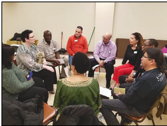
Members of the Northern Illinois Conference’s Chicago Urban Strategy engaged in group conversations at the GCORR spring board meeting.

The international board of directors and staff of the General Commission on Religion and Race (GCORR) traveled to Chicago on February 26 – March 3 to hold its 2018 spring board meeting. Chicago’s South Side, an area long troubled by gun violence, is developing innovative ways for the church to engage diverse and changing communities. GCORR was there to listen, learn, and understand how crucial urban ministry is for the mission of the church in making disciples of Jesus Christ for the transformation of the world.