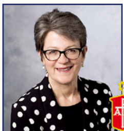
Bishop's Column: Living in Liminality ... 2