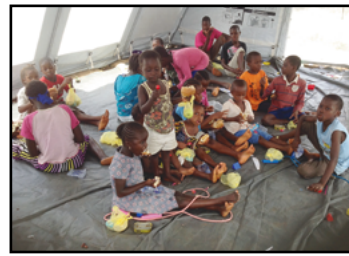
Sierra Leone Ministry Celebration ... 4