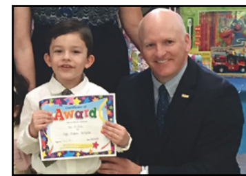
ChildServ President and CEO ... 5