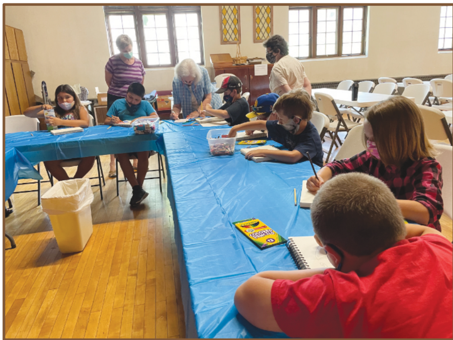
A dozen children from the small farming community in Apple River, Ill., participated in a new expressive art program this summer at Apple River UMC as part of its children and youth ministry outreach.

Bigger and younger is not always better when it comes to churches say United Methodist experts who counsel that community connections and effective ministry are better measures of a congregation's vitality.