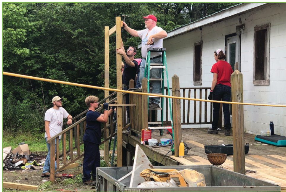
Youth and adults from Oregon United Methodist Church and St. Mary's Catholic Church, both in Oregon, Ill., repair the porch on a home in Tracy City, Tenn. The team volunteered with Mountain T.O.P., a ministry that serves families in the Cumberland Mountain region of southeast Tennessee.

After missing the opportunity in 2020 due to COVID-19, a youth group from a small northern Illinois town came to Coalmont, Tennessee, in July for its mission trip at Mountain T.O.P., a rural outreach project.