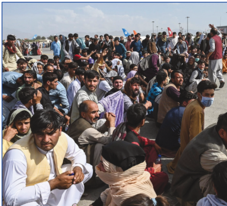
Afghans at the Kabul airport on August 18, 2021.

For more than 40 years Afghanistan has been wracked by wars, civil strife, invasion and massive amounts of arms shipped in from outside forces. It is one of the poorest countries in the world, with high infant and maternal mortality rates, and millions of Afghans have been displaced as refugees over these many years.