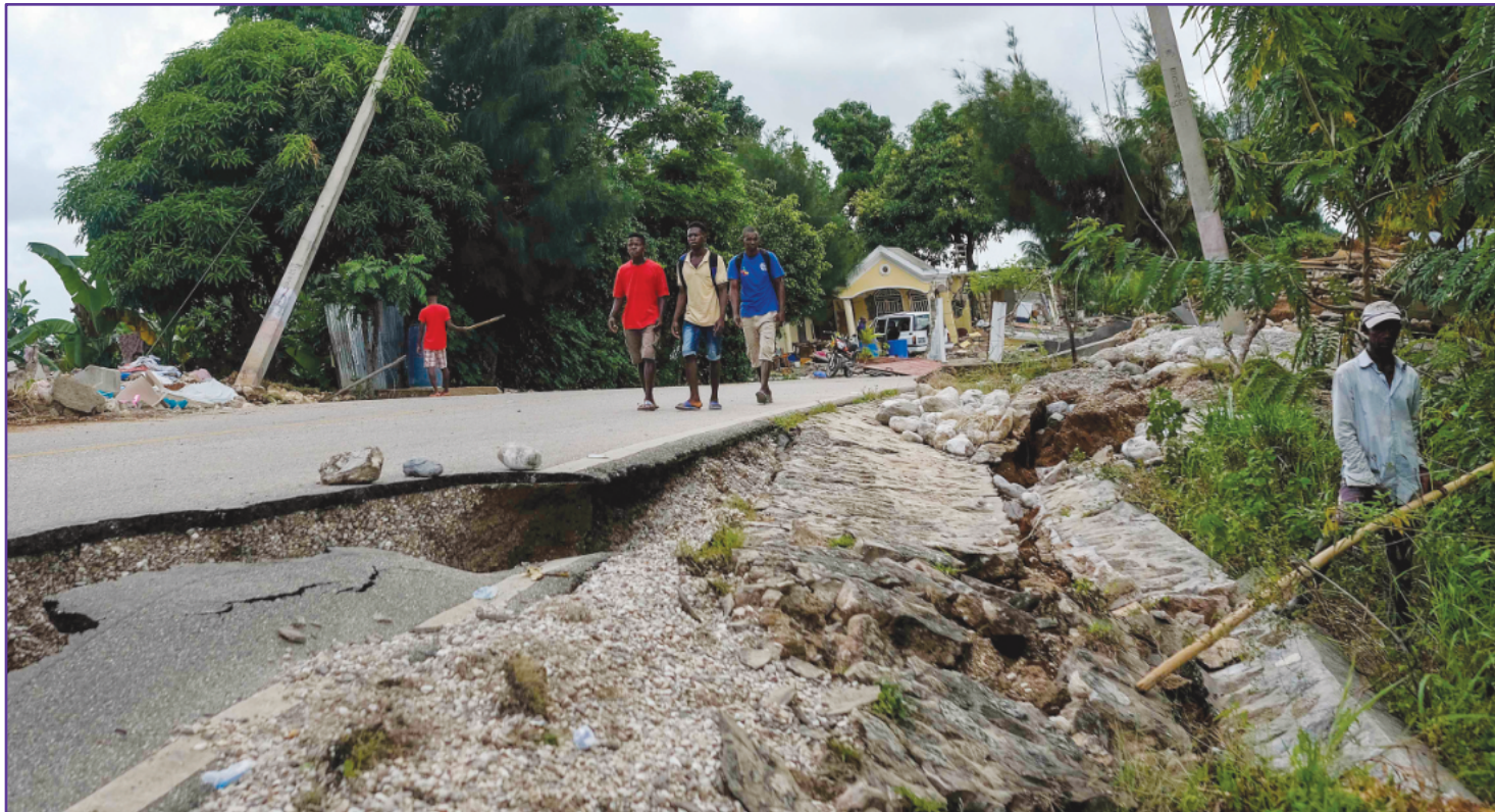
Residents walk on a damaged road in Rampe, Haiti, Wednesday, Aug. 18, 2021, four days after 7.2-magnitude earthquake hit the southwestern part of the country.