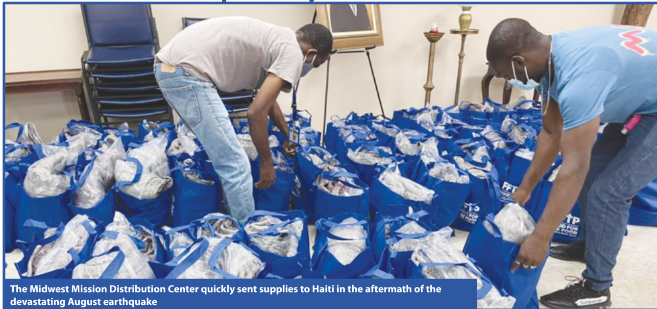
The Midwest Mission Distribution Center quickly sent supplies to Haiti in the aftermath of the devastating August earthquake

Soon after a deadly earthquake hit the coast of Haiti on Aug. 14, the Midwest Mission Distribution Center in Pawnee, Ill., received an urgent needs request and was able to get supplies to their Food for the Poor Partner and to Haiti within 24 hours!