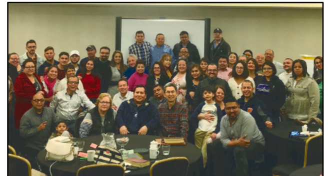
Students in the NIC Academy for Faith Community Development pose for a photo at a training pre-COVID-19 and began meeting online this summer due to the pandemic.