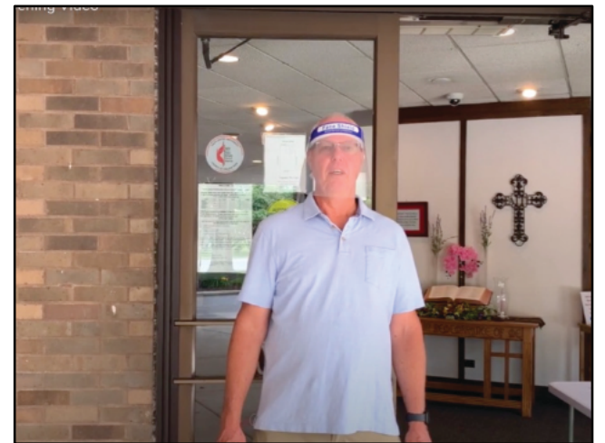
Faith UMC in Orland Park prepared an instructional video outlining guidelines before attending an in-person service, including mask wearing, reservation instructions, bathroom protocols, and sanitization efforts.