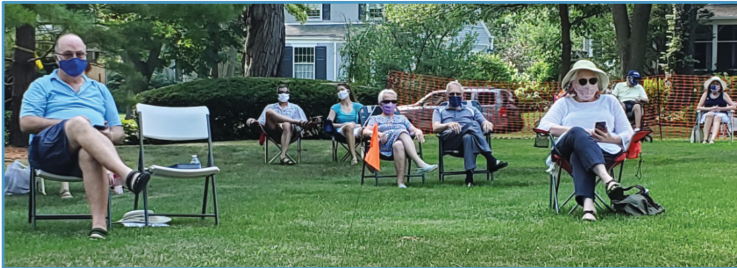
Members of Trinity UMC in Wilmette gather on the church's lawn for an outdoor worship service while practicing social distancing and wearing masks to help stop the spread of COVID-19.