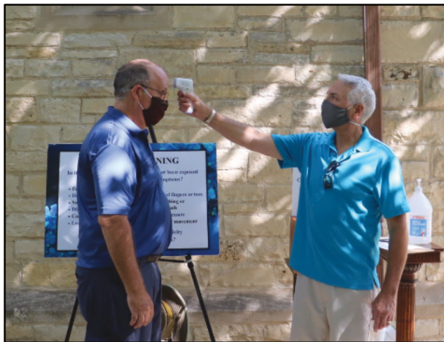
An usher at Trinity UMC in Wilmette takes the temperature of a church member before attending a Sunday morning in-person worship service.