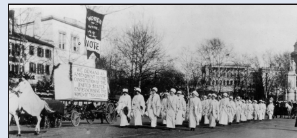
Women march in the 1913 Women Suffrage Procession in Washington. Methodist women played a significant role in the ratification of the 19th Amendment.

Join me in making your plans now. Register to vote by October 18; you can do so online. Plan your trip to the polls; put it on your calendar or sign up to vote by mail to ensure your voice—your vote—counts.